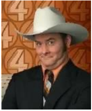
Third Base Coach, Champ Kind