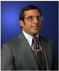
Pitching Coach, Brick Tamland